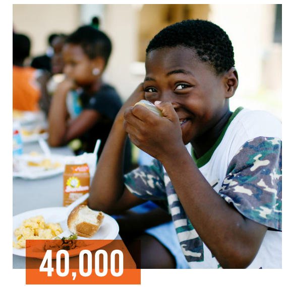
summer meals sites to feed kids when school is out.