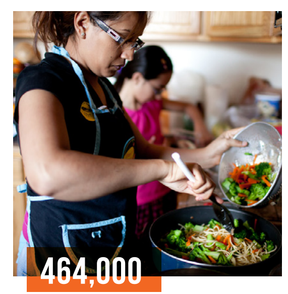
families taught how to purchase and prepare healthy food through our Cooking Matters program.