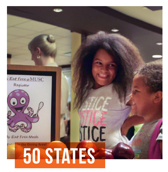
receive grants supporting the best local organizations that feed kids.