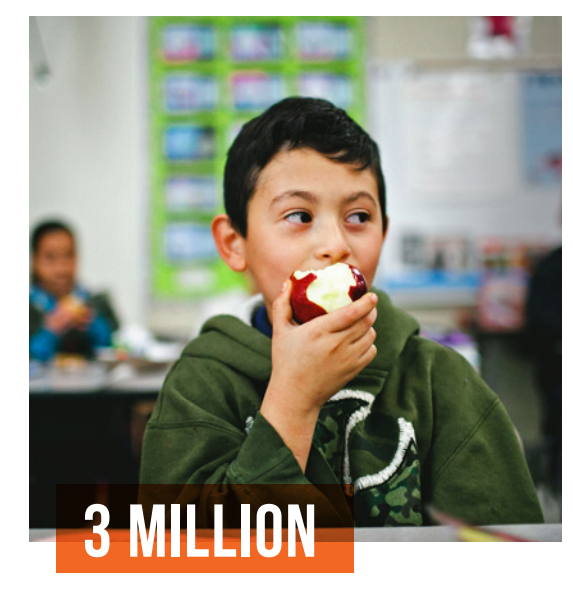
more kids eating school breakfast since the launch of our campaign.

That means more kids are eating school breakfast; schools have launched afterschool meals programs; low-income parents know where to find free summer meals for their kids in their communities; and families have the knowledge they need to stretch their food budgets.